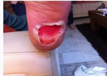
LN2 Week 2