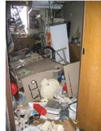
Figure 3 - Inside the Laboratory after Explosion

The catastrophic failure of the nitrogen cylinder was a direct result of the removal and subsequent plugging of the internal tank pressure relief devices. The cylinder was modified by inexperienced and unidentified person(s) resulting in the eventual failure of the cylinder. It could not be determined when the modifications took place.