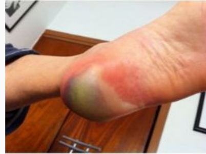
LN2 Burn Week 1