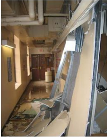
Figure 2 - Hallway Outside Laboratory Showing Explosion Damage

At approximately 3:00 a.m. on Thursday, January 12, 2006, an explosion occurred in a state university chemistry building laboratory, causing substantial building damage. The explosion resulted from a rupture in a liquid nitrogen (Dewar) cylinder. The cylinder was originally constructed and tested in December 1980.