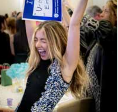
Match Day 2023.